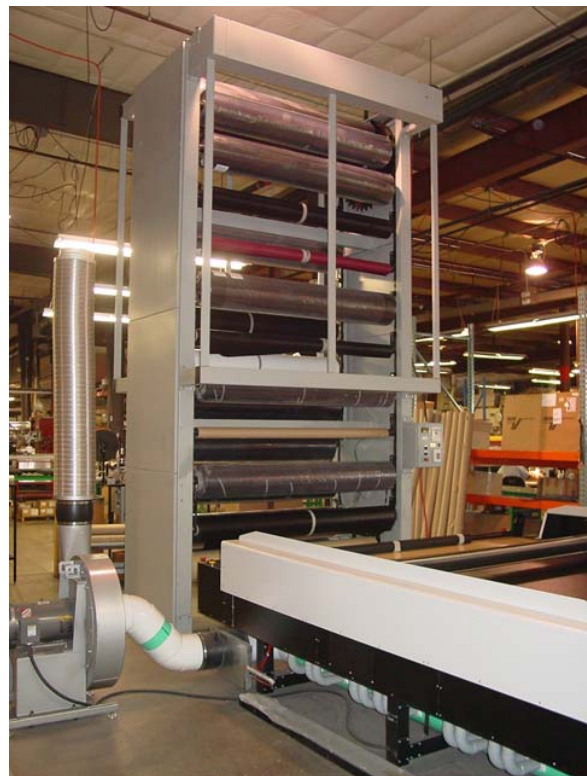
RollMaster Vertical Carousel