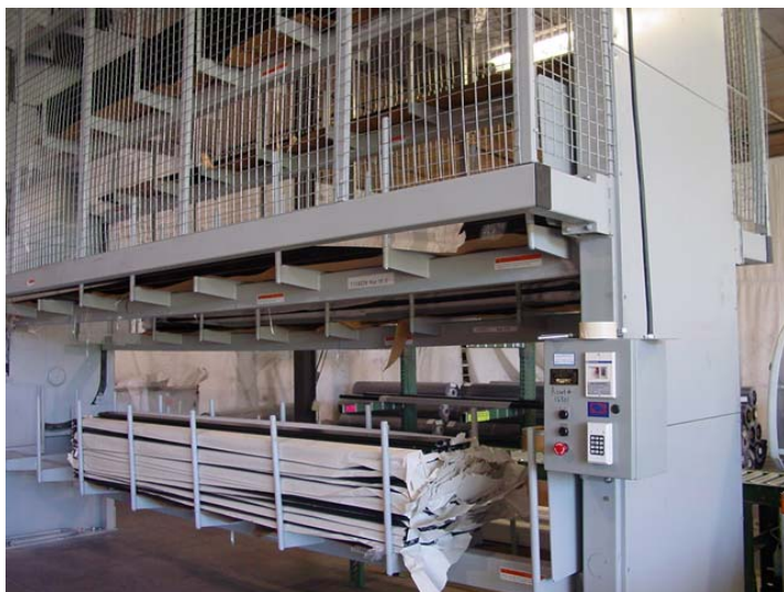
Bar Stock Vertical Carousel

Prior to having a Bar Stock Vertical Carousel installed, Shur-Co® handled their