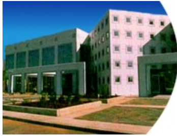
Chromalloy location Carson City, Nevada