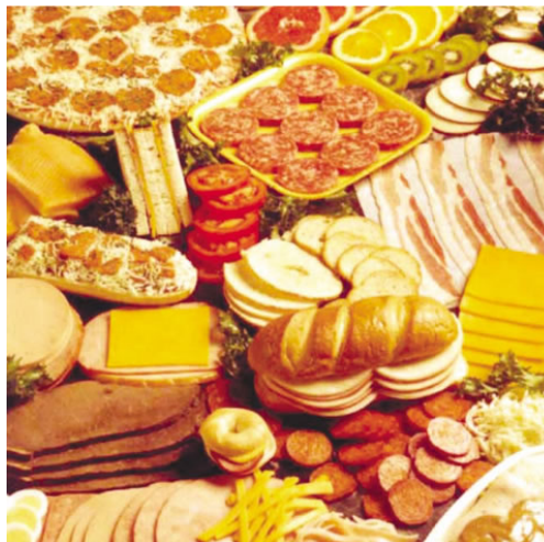
Grote Co. revolutionized commercial food preparation