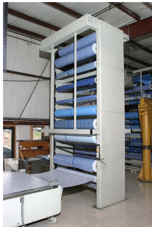
J & D's Rolled Goods VC is versatile and streamlines production

When you think of improving productivity and reducing cycle time, go vertical with a Rolled Goods VC from J & D Associates!