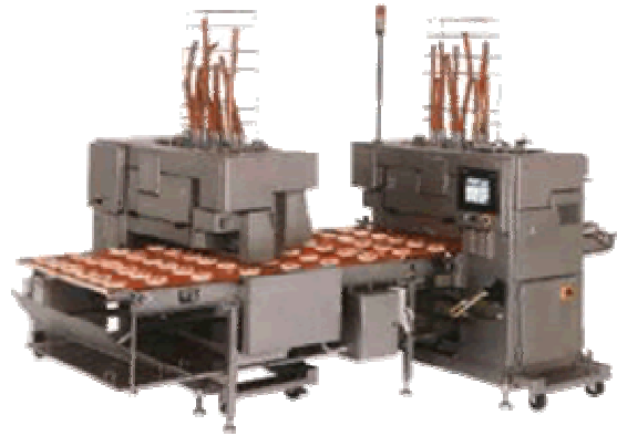
Grote Slicer Application Machine

When you need to store and retrieve your production materials, J & D Associates has a system to fit your needs.