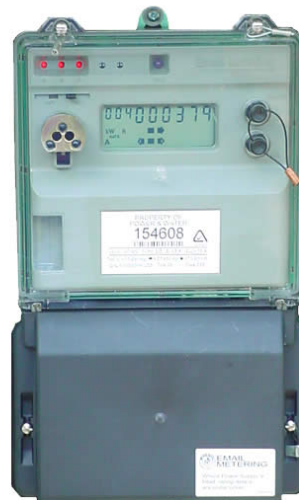
Meter Used for Business