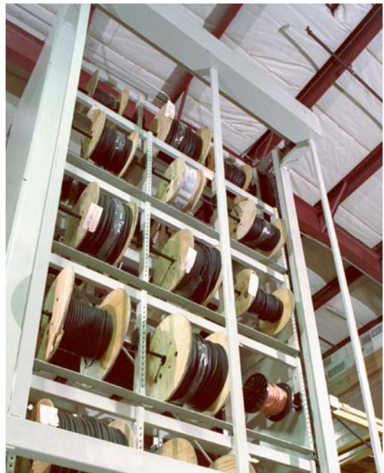
Wire Spool Vertical Carousel

The time savings realized through using the Wire & Spool VC is significant for Kleen-Rite. Their warehouse must meet peak demand for their products. The time-savings and efficiency is significant enough to justify the cost of the Wire & Spool VC.