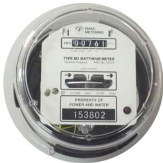
Meter Used for Home