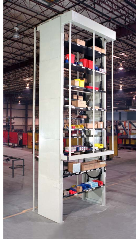
Tray Vertical Carousel

By going vertical, Itron keeps up with peak demand periods while giving their employee's an ergonomic alternative to use racks and lifts. Go vertical with J & D Associates Vertical Carousels.