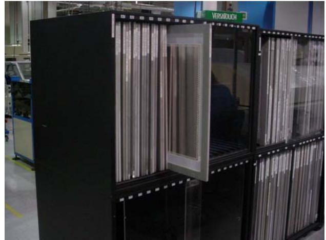
Current Method of Storing and Retrieval

Hybrid Innovation is Nothing New to J & D Associates!