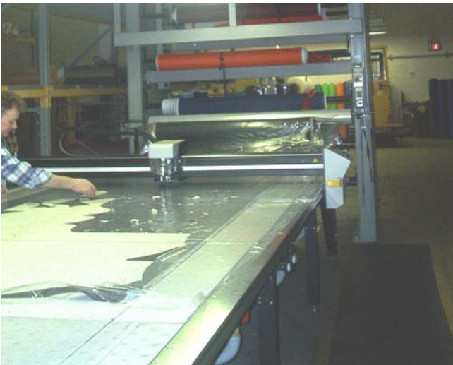
A. Rifkin Company Manufacturing Facility