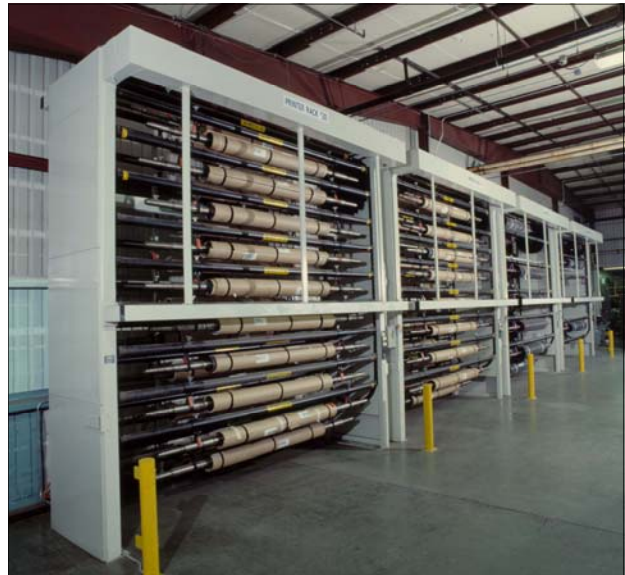
Print Cylinder VC Installation

Often, after purchasing their first Print Cylinder VC and realizing the value and ease of handling their print cylinders, additional Print Cylinder VC's are then purchased! They are set side by side for quick and safe retrieval of the company's expensive Print Cylinders.