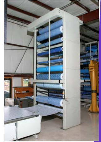
Pen Fabrication Application

the amount of time spent handling rolls and keeps the cutting machine cutting patterns. Two additional systems have been added and the company looks forward to continued growth. Pen Fabrication is located in Emigsville, PA. Installation was completed by J & D Associate's. The unit shown is a variation of J & D's Roll-MasterVC (vertical carousel) and configured to meet Pen Fabrication's ceiling requirements as well as the width of their rolled goods. The unit is simple to operate and one operator can load and unload the rolled goods utilizing J & D's "V-dolly" loading cart