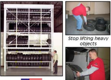
Stop lifting heavy objects

Tire Vertical Carousel Next to the common cold, back injuries are the biggest reason employees miss time from work.