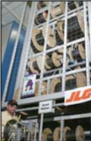
Wire & Spools