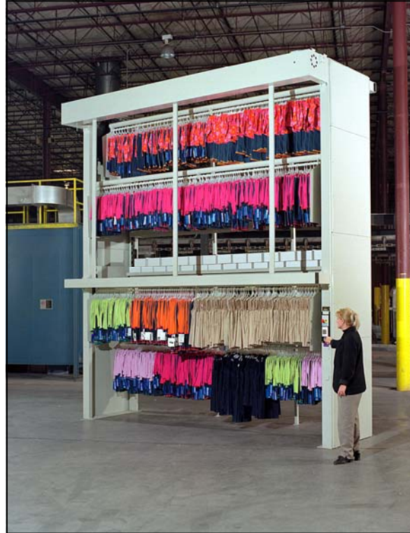
Garment Vertical Carousels Offer Versatile Storage Options

The rest of the carriers store worker's uniforms that can be accessed during shift changes at the Casino. The workers get their fresh uniform from the carousel before their shift begins. After the shift is over the garments go to the cleaners. After the garment is cleaned and pressed, it is stored on the Garment VC. Go vertical today with a Garment VC from J & D Associates!